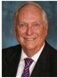
Norman S. Edelcup Mayor

Sunny Isles Beach Government Center 18070 Collins Avenue Hours of operation: Mon - Sat, 10:00 am - 4:00 pm www.sunnyislesbeachmiami.com 305.792.1952