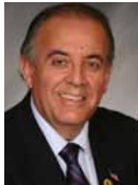
Isaac Aelion Commissioner