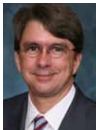
George 'Bud' Scholl Commissioner