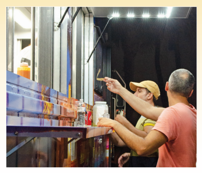
Saturday, August 10, 5:00–8:00 pm Samson Oceanfront Park • 17425 Collins Avenue

Relax at this free summer event by the sea with live music, along with food and drinks available for purchase.