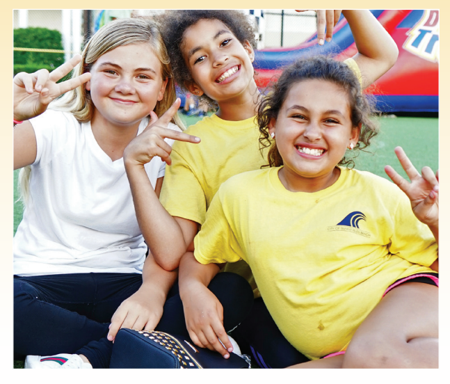
Friday, August 16, 5:00–8:00 pm Pelican Community Park • 18115 North Bay Road

Learn about what's in store for fall, with information from the NSE/SIB K-8 School, SIB Police Department, uniform shops, and activities for youth and adults.