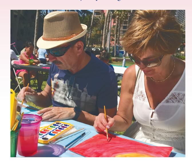
Sunday, July 28, 11:00 am–1:00 pm Samson Oceanfront Park • 17425 Collins Avenue

Each month practice a different dance technique or hone your painting skills.