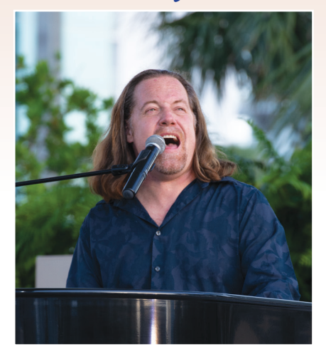
Saturday, July 27, 7:30 pm Gateway Park, 151 Sunny Isles Boulevard

It's a night of piano party madness, as internationally renowned performers take your song requests in a clap-along, crazy party where all things fun can happen!