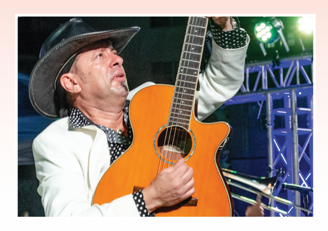
Saturday, September 21 • 7:00 pm

Enjoy an evening of popular and traditional music and dance.