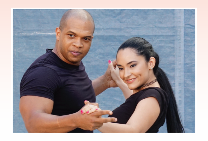
Sunday, September 22 • 5:00 pm

Immerse yourself in this rich and diverse culture, featuring vendors and performers from our local community.